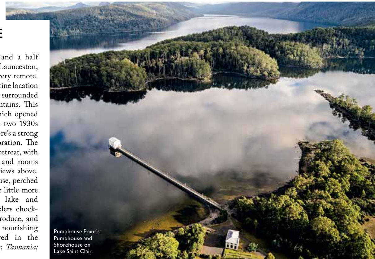
Pumphouse Point's Pumphouse and Shorehouse on Lake Saint Clair.

Although only two and a half hours' drive from Hobart or Launceston, Pumphouse Point feels very, very remote. But that's the allure of this pristine location on Tasmania's Lake Saint Clair surrounded by arctic rainforest and mountains. This 18-room wilderness lodge, which opened in January 2015, is housed in two 1930s hydroelectric buildings and there's a strong sense of the past in the restoration. The Shorehouse is the heart of the retreat, with a dining room and lounge, and rooms offering lake and mountain views above. Guests staying at the Pumphouse, perched at the end of a long jetty, hear little more than the lapping of the lake and birdsong. All rooms have larders chock-full of delicious Tasmanian produce, and a generous breakfast and nourishing shared-table dinner is served in the dining space. Lake Saint Clair, Tasmania; www.pumphousepoint.com.au.