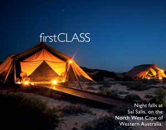
Night falls at Sal Salis, on the North West Cape of Western Australia.