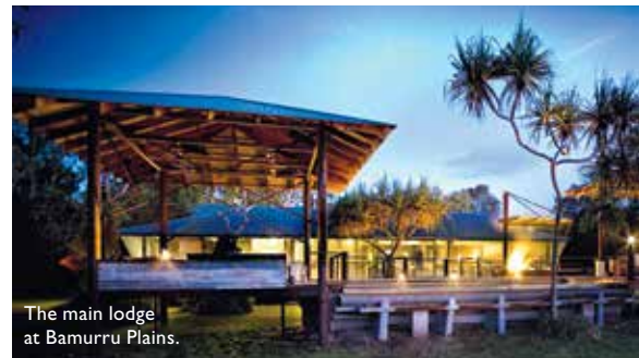
The main lodge at Bamurru Plains.

and serene retreat. Two self-contained suites take up the entire ground and first floors of the original bluestone house, with another two suites housed in the contemporary metal-skinned addition at the back of the building. With opulent interiors and a "maxi-bar" in each room that offers a wide range of fine local fare at reasonable (that is, not mini-bar) prices, it's no wonder Drift House has already made such a splash. 98 Gipps Street, Port Fairy, Victoria; drifthouse.com.au. Go to www.mrandmrsmith.com for extras when booking.