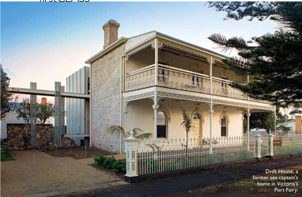
Drift House, a former sea captain's home in Victoria's Port Fairy.