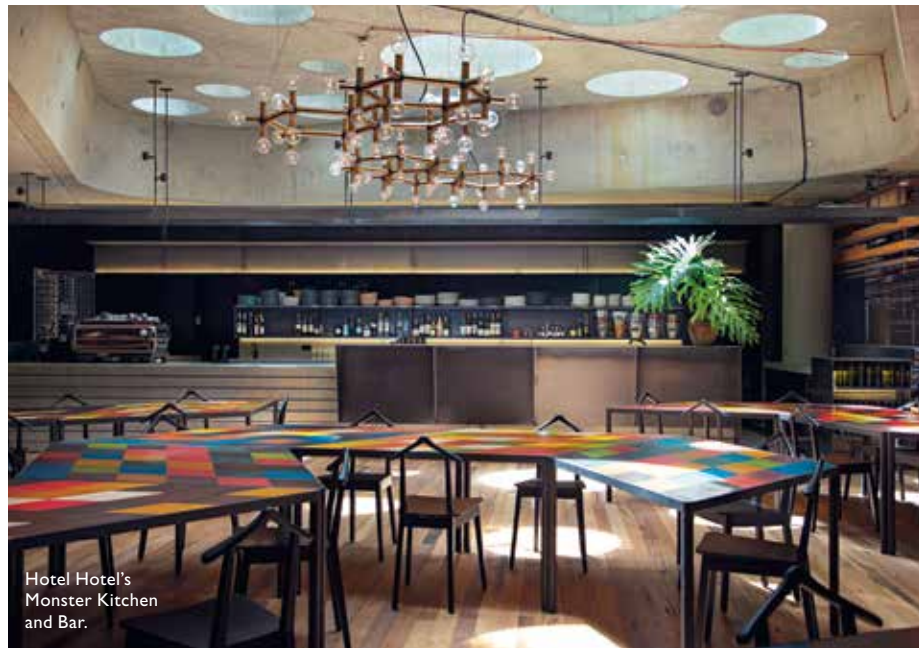
Hotel Hotel's Monster Kitchen and Bar.

With just 16 safari tents connected by boardwalks above the dunes in Cape Range National Park, on the North West Cape of Western Australia, Sal Salis is as laidback as it is spectacular. Ningaloo Reef, a 280-kilometre-long fringing coral reef, starts a few metres offshore from the sandy beach of the campsite, so a day's entertainment at Sal Salis revolves around snorkelling to spot the vividly coloured fish, stingrays and turtles of this part of the Indian Ocean, and venturing further out to sea to spy filter-feeding whale sharks and humpback whales in season. While the tents are comfortable and excellent Western Australian wines complement the Australian bush cuisine prepared by the lodge's resident chef, you should note that all fresh water is transported to the site and you'll have a daily allocation of 20 litres for showering and washing – so there's no need to pack that Bumble & bumble sea salt spray. Cape Range National Park; www.salsalis.com.au.