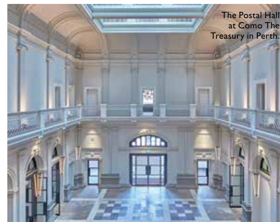
The Postal Hall at Como The Treasury in Perth.