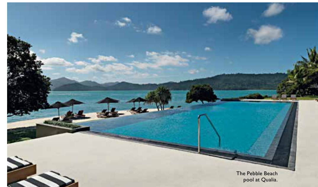
The Pebble Beach pool at Qualia.

Qualia is that rare combination of pure luxury in a sublime setting. With rooms featuring private plunge pools and drink-me-in views of the Coral Sea and the surrounding eucalyptus bushland through louvres that invite in the sea breeze to cool and soothe you, this is the ultimate retreat for the world-weary or the loved-up. The Pebble Beach waterfront terrace is the place to haunt for lunch, with its expansive views of the sailboat-dotted waterways between the neighbouring tree-clad islands – it's tempting to linger here for a dip in the infinity pool, followed by the regular afternoon drinks session. And then, well, it's almost time for those pre-dinner cocktails, which also happen to be served down at Pebble Beach ... Hamilton Island, Queensland; www.qualia.com.au.