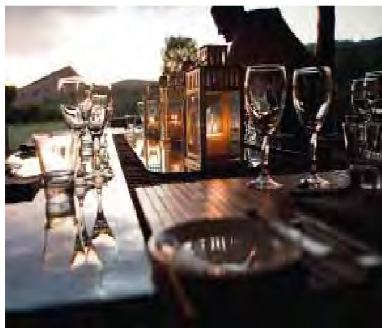
Clockwise from above: South Australia is world-renowned for its wines; The Louise in the Barossa Valley offers scenic hiking; The eco-smart fireplace at Kangaroo Island's Southern Ocean Lodge; Arkaba Station in the Flinders Ranges serves drinks alfresco.

Discover regional riches and the redefinition of luxury at South Australia's indulgent lodges.