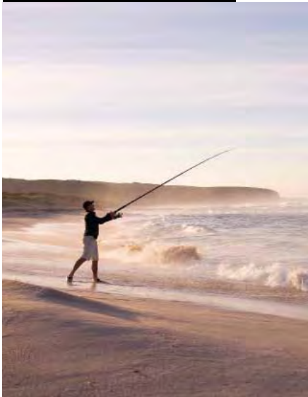
Clockwise from top left: Go beach fishing for garfish or snook on Kangaroo Island; Dramatic views from the Pavilion at Southern Ocean Lodge; The suites here epitomise subtle luxury.