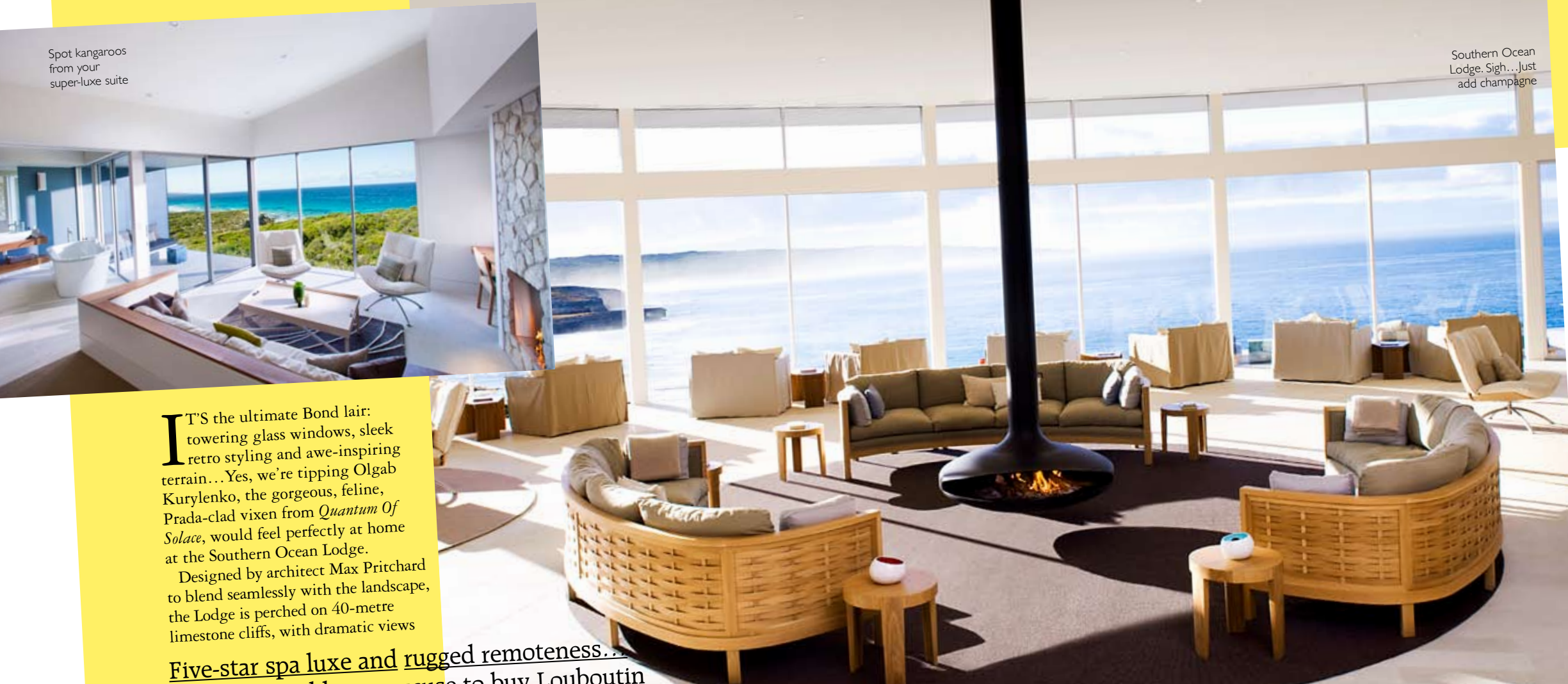
Southern Ocean Lodge. Sigh... Just add champagne

IT'S the ultimate Bond lair: towering glass windows, sleek retro styling and awe-inspiring terrain... Yes, we're tipping Olgab Kurylenko, the gorgeous, feline, Prada-clad vixen from Quantum Of Solace , would feel perfectly at home at the Southern Ocean Lodge.