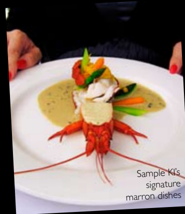
Sample KI's signature marron dishes

A seafood addict? Make a stop at the Marron Café for a crustacean fix.