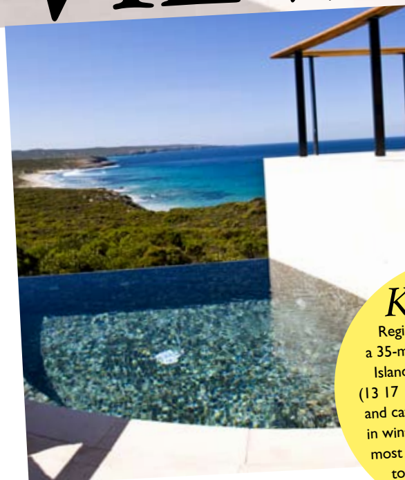
The Lodge was designed to complement the pristine surroundings